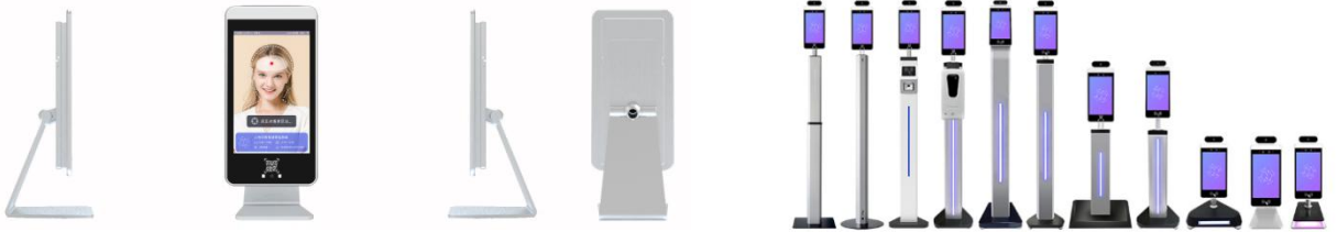
Floor Stand / Column